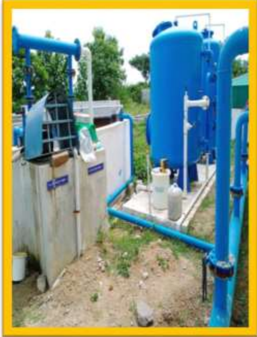
FilterFeed Pump –I&II