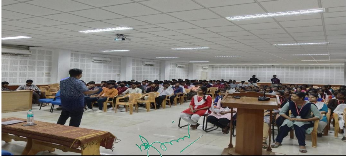
Karpaga Vinayaga College of Engineering and Technology Chinnakolambakkam, Maduranthagam T.K - 603 308 Changalpathu Districi