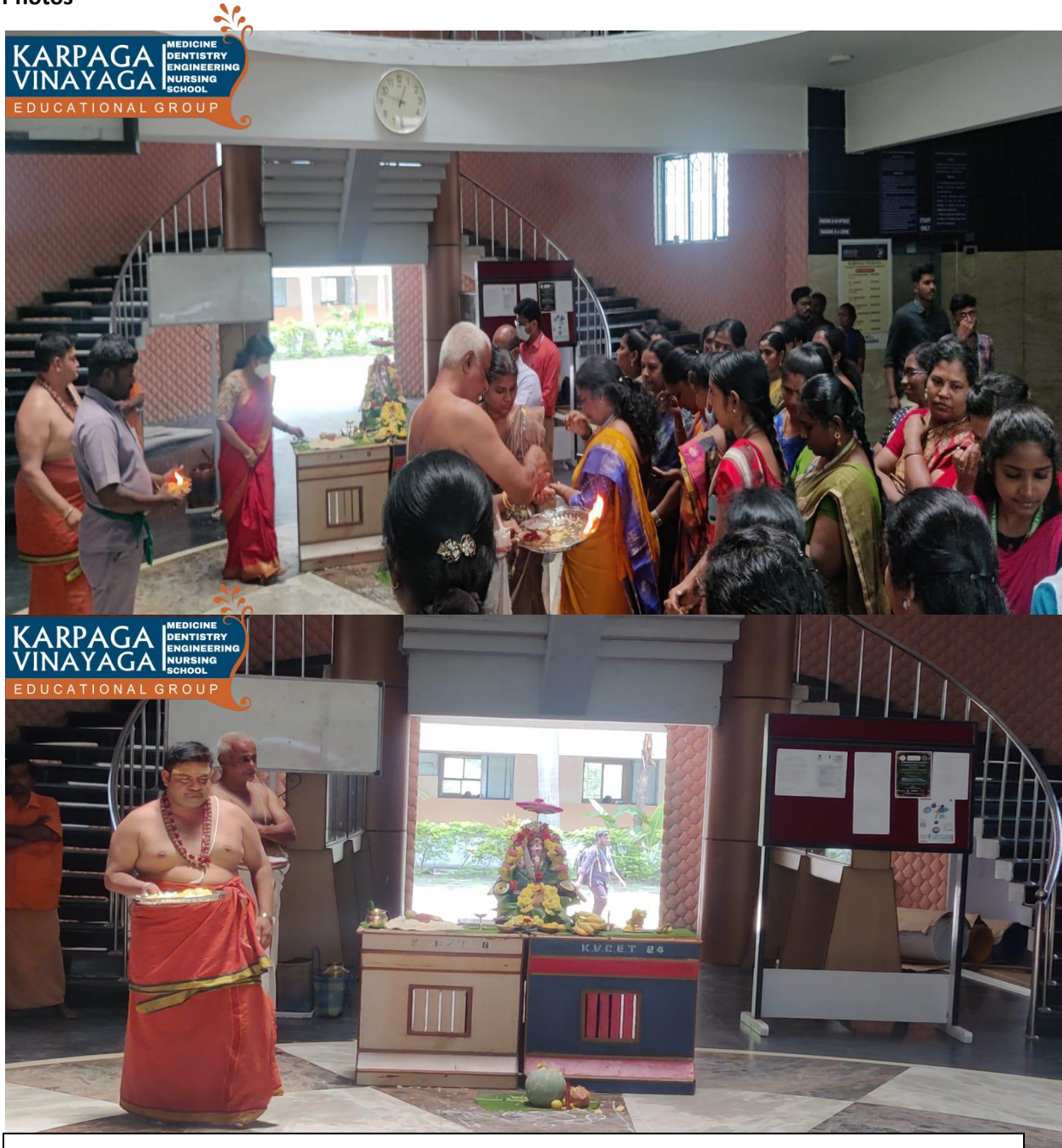
Ganesh Chaturthi celebration