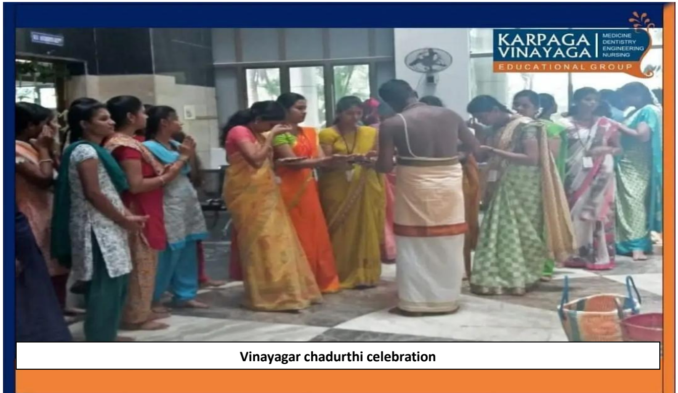
Vinayagar chadurthi celebration